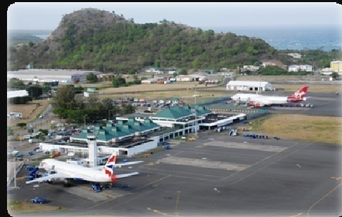
Hewanorra International Airport

Visit our Website at www.slaspa.com for Aircraft, Ferry, Cruise and Cargo Vessel Schedules