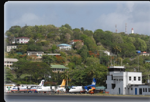
George F. L. Charles Airport