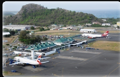
Hewanorra International Airport

Visit our Website at www.slaspa.com for Aircraft, Ferry, Cruise and Cargo Vessel Schedules