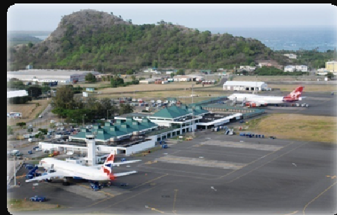
Hewanorra International Airport

Visit our Website at www.slaspa.com for Aircraft, Ferry, Cruise and Cargo Vessel Schedules