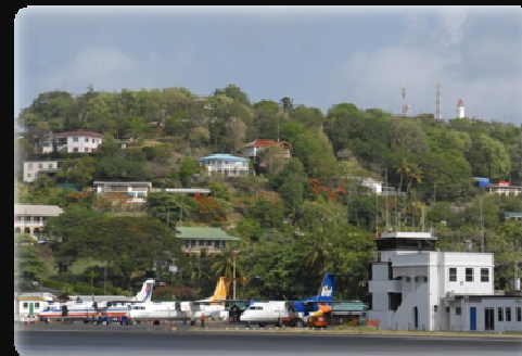
George F. L. Charles Airport